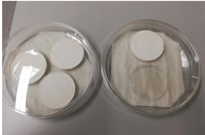
Fig-1. Paint samples and controls during incubation in Petri dishes.