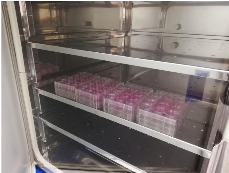
Fig-2. MDBK cells in 12-well plates in a CO2 incubator.